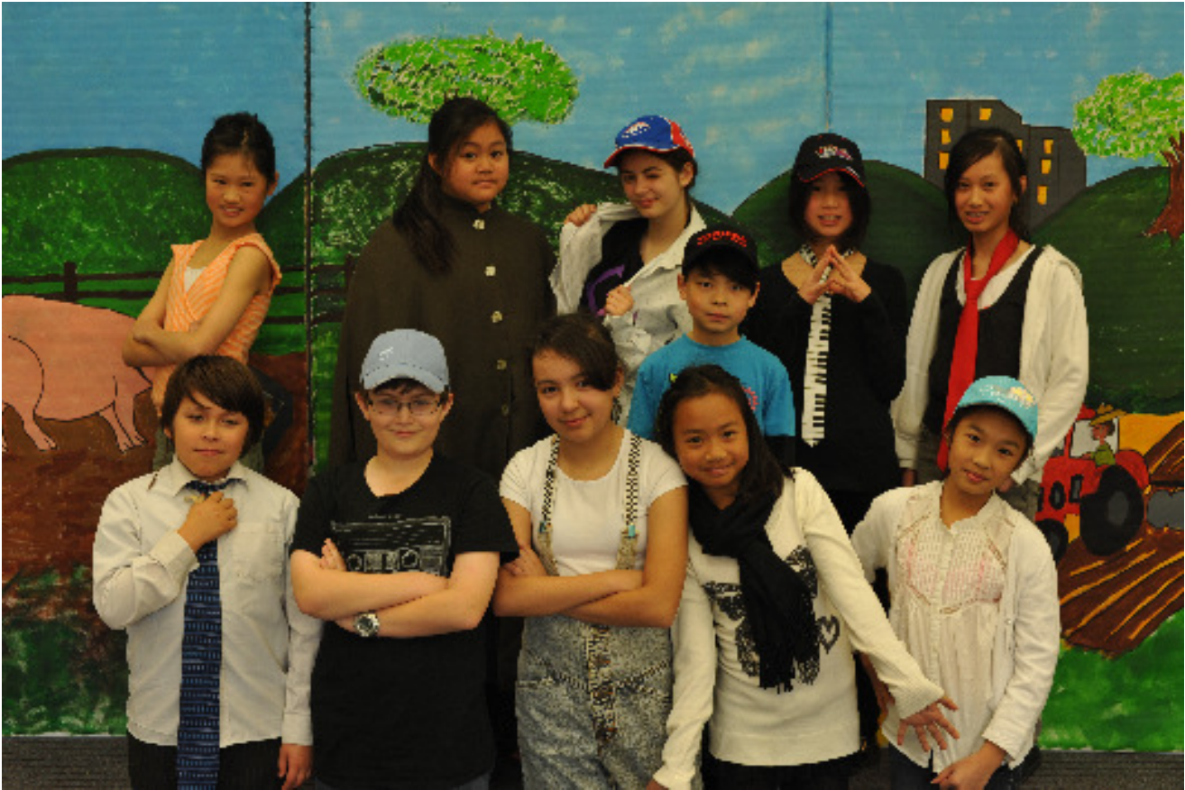
Musical Production “Striking Out” 2011

The school produces a musical on alternate years, however due to the current building project the next musical will occur in 2013. Every child has a part to play.