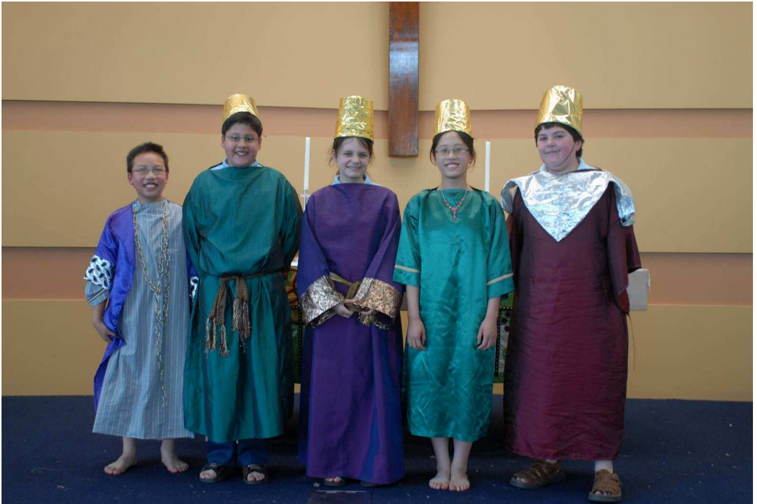
Musical Production "Daniel" 2008

The school produces a musical on alternate years, however due to the current building project the next musical is not scheduled until 2011. Every child has a part to play.